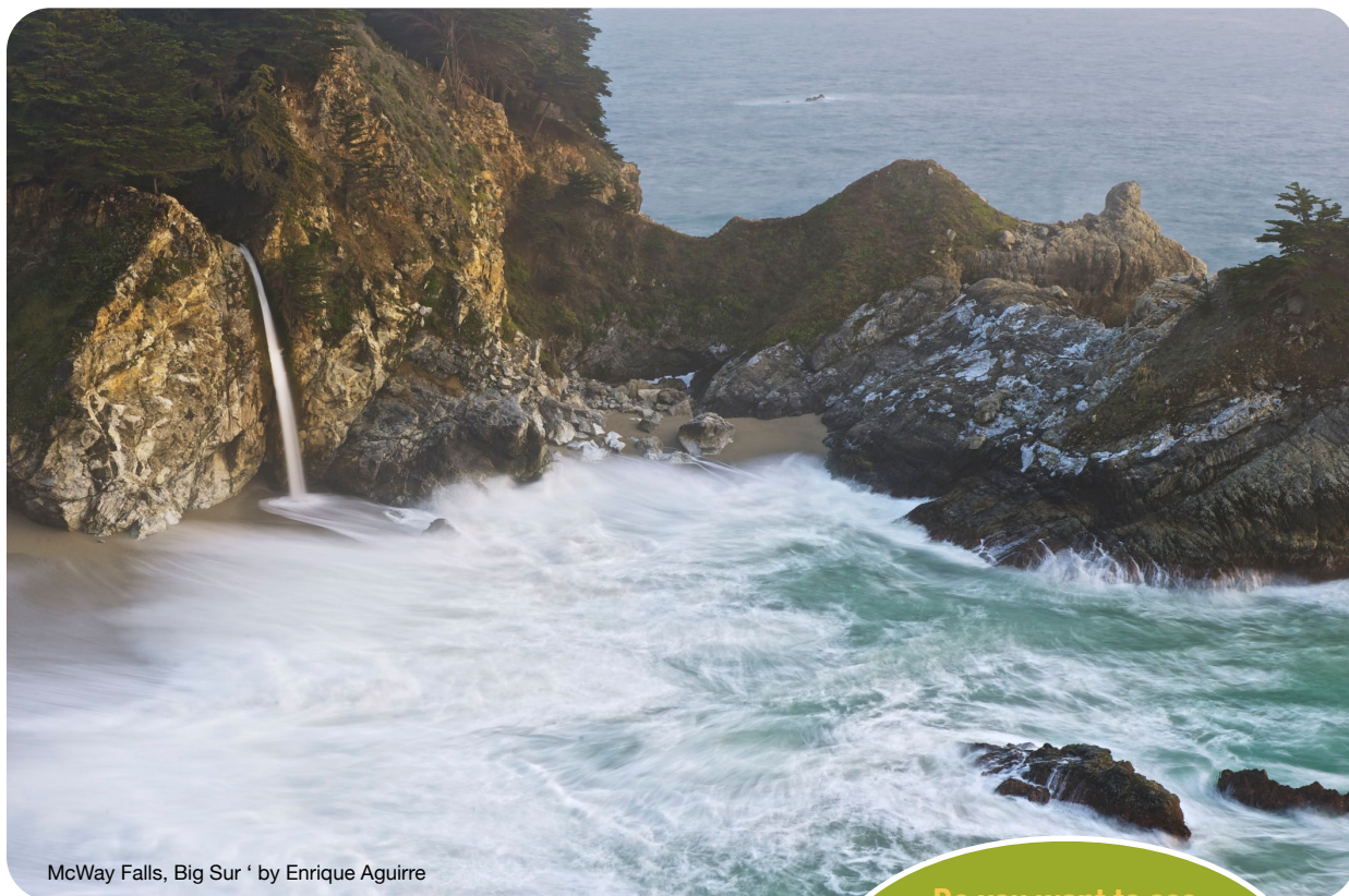
McWay Falls, Big Sur

Do you want to see your photos in ColorNews?