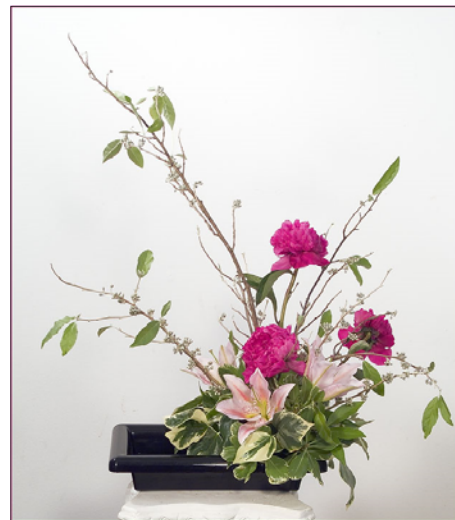
Freestyle Ikebana by Yukiko's Design Studio

3 trees., and so on. Observe Japanese Bonsai work or flower arrangements.